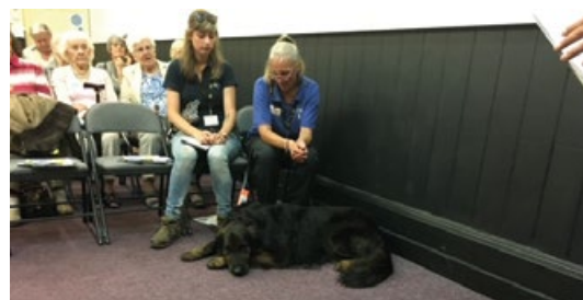
Korky the guide dog with his two trainers (from 22/09/2016 ARM at the Barnfield)